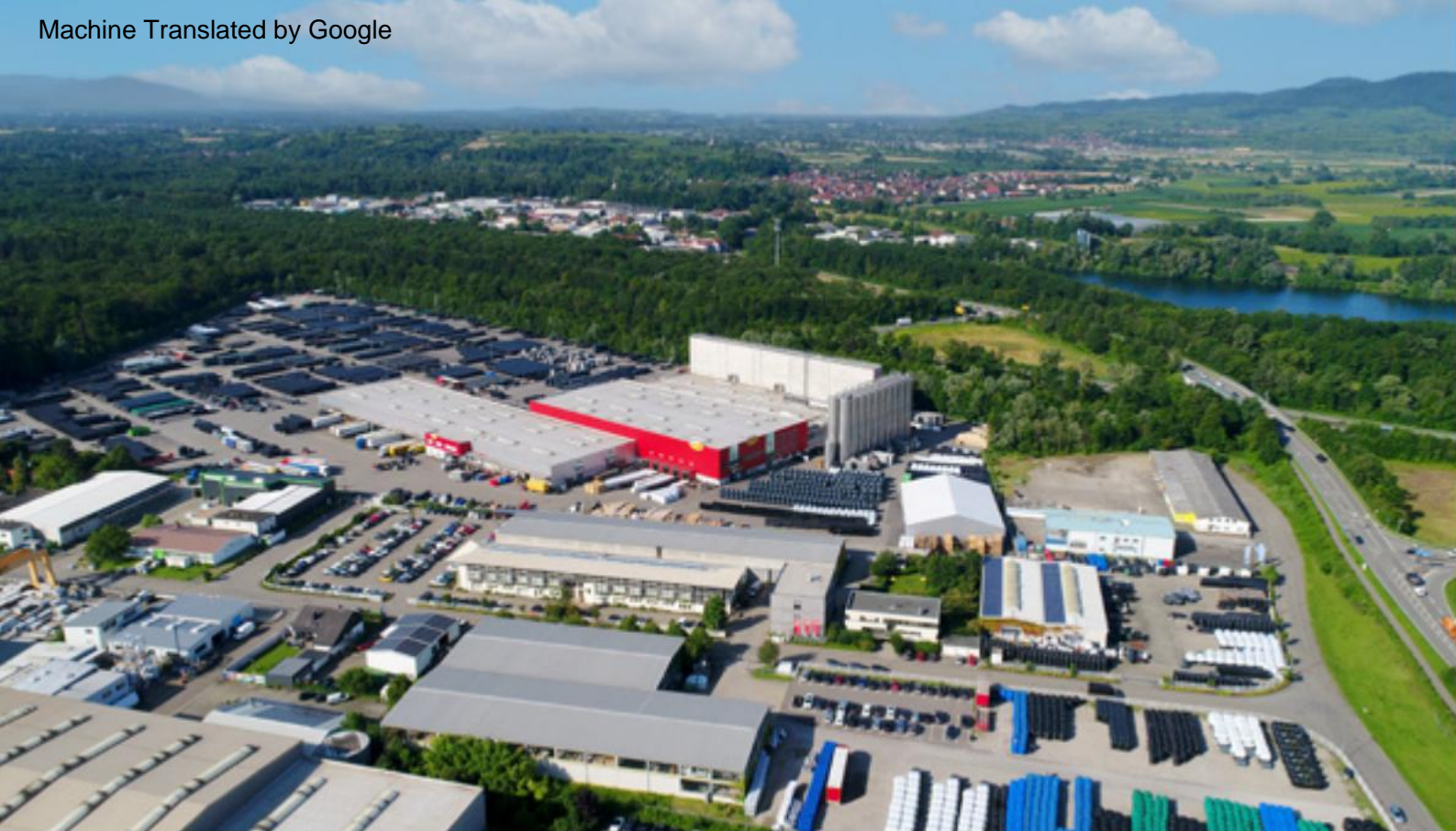
Teningen plant near Freiburg