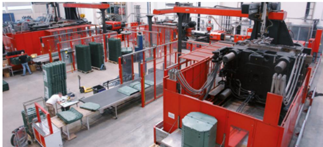
Production injection molding machine

We feel a strong connection to Germany as a business location. On the one hand, we are deeply committed to this location with our tradition. On the other hand, we find the qualified and motivated employees here to maintain our high quality standards.